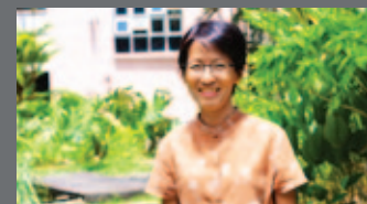
Motivated from Within