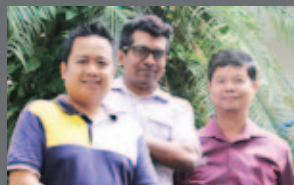
Teaching for Success