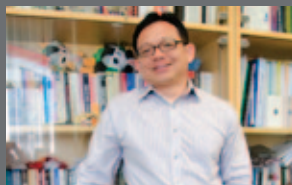
Bringing out the Best in Students