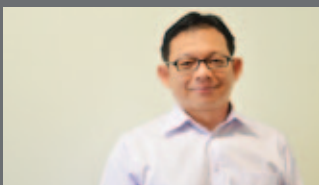
From Theory to Practice