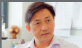
Creating a Good Learning Environment