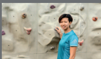
Nurturing Young and Confident Leaders