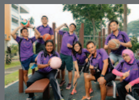
Outside the Classroom, Into the Field