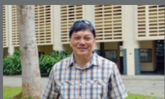
Fostering a Sense of Place through the Outdoors