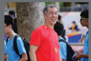
3 Ways to Make Sports Day Engaging for Every Student