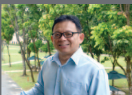
Creating Meaningful Outdoor Learning Experiences