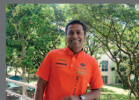
Equipped for Everests