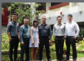
A Classroom Without Walls