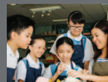
Future of Learning: Getting It Right for Digital Natives