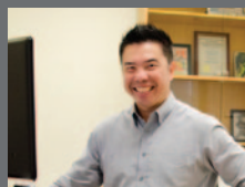
Choosing to be Wise and Healthy