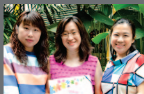
Going beyond Concept Cartoons