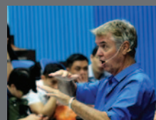
What Does Success Look Like?