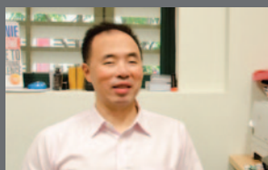
Learning with Assistive Technology