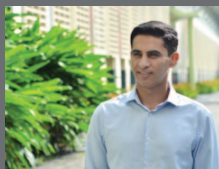
Integrative Learning through Problem Finding