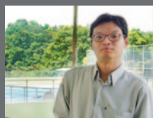
Learning Chinese Seamlessly