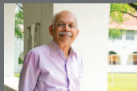
SingTeach : 10 Years On