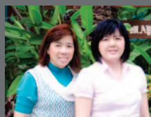
Every Pupil a Potential Achiever