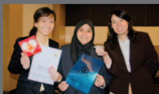
Campaigning for Altruism