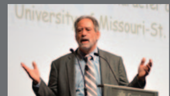
Fostering Character and Values