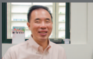
Working for Students with Special Needs