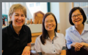
A Culture of Care