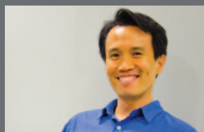
Becoming an Inclusive Society