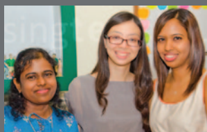
No Child Left Unattended