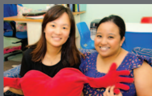
Nurturing an Inclusive School Culture