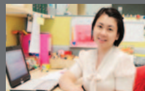
Teaching with Inquiry