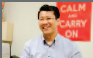
The Makings of History