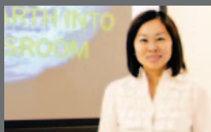
The World at Your Fingertips